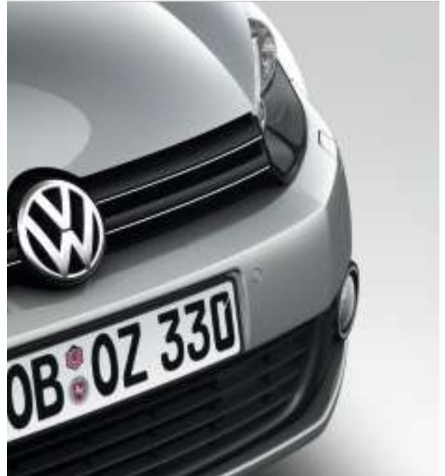
Without Volkswagen V-Protector