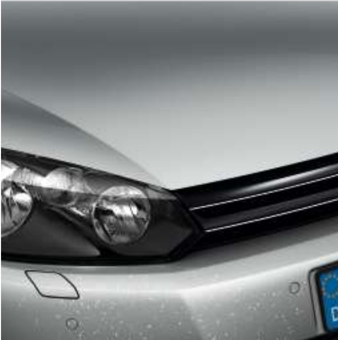
With Volkswagen V-Protector